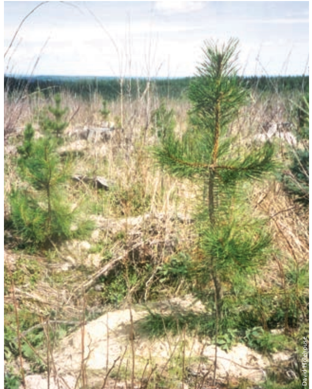
Program helps maintain reforestation standards

For more information, check the website at www.friaa.ab.ca .